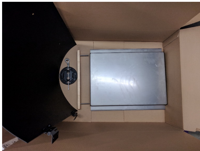
Pictured from left to right: Grill Lid, Damper, Handle, Baffle (Grates and Pizza Stone not pictured)

While the Efficiency Baffle and Sapling Grill Grates pop in and out of the Sapling much like the Sapling Evaporator Pan , the Sapling Grill Lid and Sapling Damper require some assembly and installation. Follow the directions below.